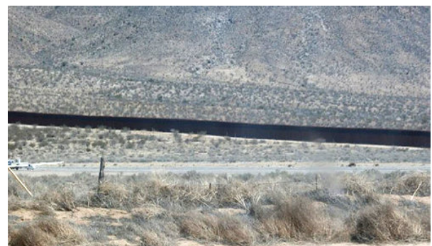
The international border “fence” as seen from the Jacumba Inn.