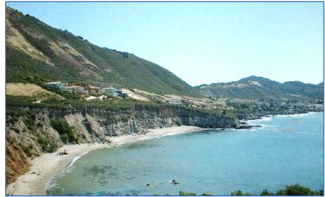
Pirates Cove is near San Luis Obispo, along the Central California Coast.

We are all volunteers; there is no paid staff. We can always use more help. If you think you can spare a little time each month, please give us a hand as the more eyes we have working on this the better the job we can do for all nudists everywhere. Contact us at information@aanrwest.com if you want to give us about an hour of your time per month to help protect your naturist way of life.