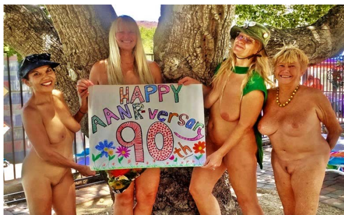
Women leaders at Glen Eden's Open House Celebrate AANR's 90th AANR-versary.