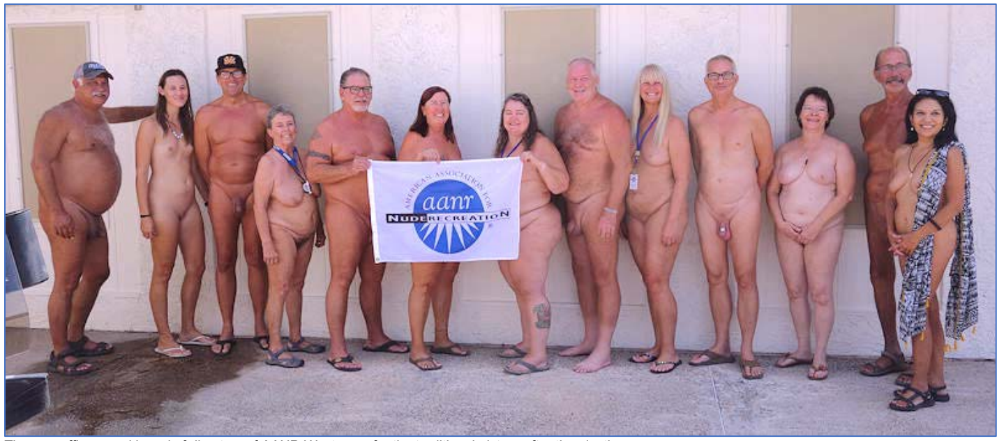
The new officers and board of directors of AANR-West pose for the traditional picture after the election.