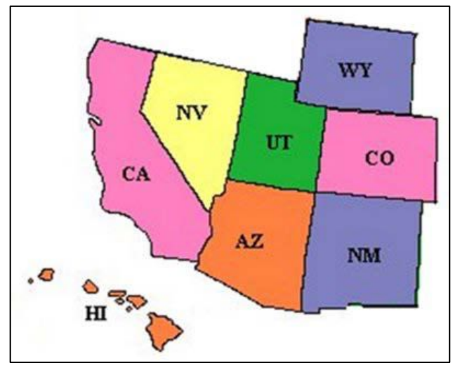
The AANR-West region covers eight states and western Mexico.