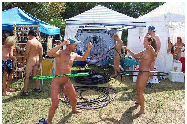
Photo above is from 2019 event. The hula hoop booth was popular this year also!

September 18-20 - The music part of our annual Nudestock Festival was cancelled but some of our favorite Nudestock vendors created an outdoor bazaar instead, with many individual booths. Members and guests loved it!