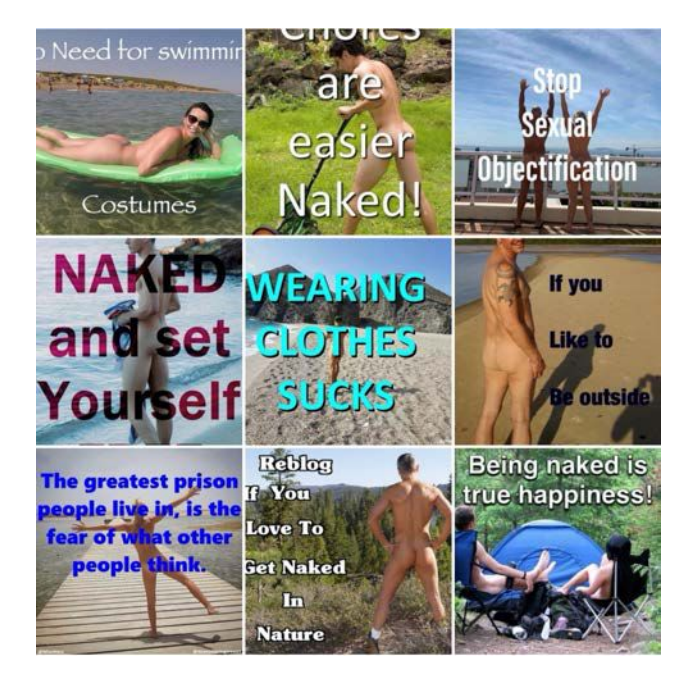
Their stories purposely feature all body types, not just one shape, size, or color.

One of the first efforts of the AANR West Young Adults committee was to work with the Social Media team to start an Instagram account (@AANRWest ). We quickly began to find body acceptance influencers sharing nude-positive stories and images with a "body acceptance" motif. Some of these wellness ambassadors have thousands of followers who turn to them daily for inspiration and entertainment.