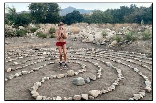
The Spirit Dance Labyrinth is Born

Walking along the berm trail south of dry camping, you'll find a treat—a lovely labyrinth built with concentric circles of stones. We invite you to enter from the east and walk in meditation. Not a maze, a labyrinth is an ancient traditional path used to find purpose and renewal, recover balance and insight and promote self-reflection. It is a journey, not a destination.