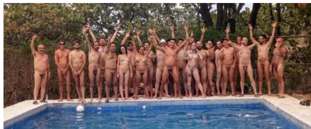
The club members of NNGuadalajara.