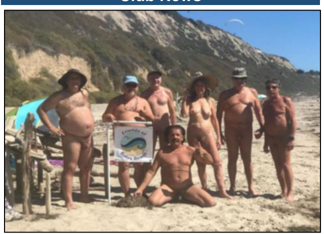
After the Beach Cleanup, a few of the volunteers enjoyed a clothing-optional picnic at Bates Beach. Santa Barbara County.