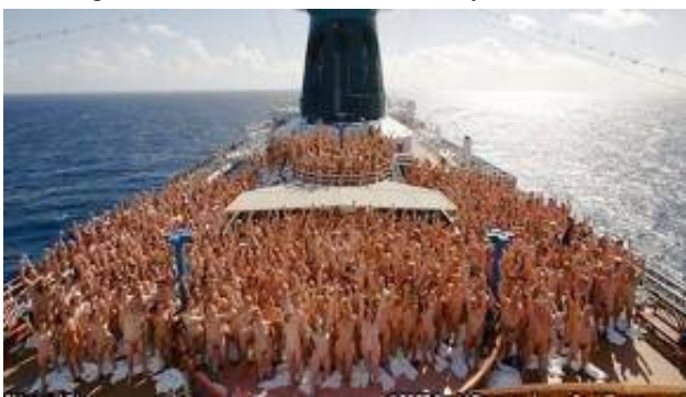
Traditional group photo of the 2400+ passengers on board the Carnival Sunshine nude cruise.

The days in between ports were spent trying to keep track of the non-stop events planned by both Carnival and Bare Necessities. The daily itineraries were overflowing with challenging games, fun activities and informative lectures. Nudity was the (un)dress code virtually everywhere with exceptions of times at port or in the ship's dining rooms. The staff on board was professional and responsive, the meals plentiful and the entertainment amazing. As I disembarked along with my 2800-plus new nudist friends, the atmosphere was bittersweet though made easier knowing I now am that much closer to my next nude cruise!