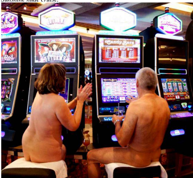
Between ports, many passengers gambled away the rest of their retirement money in the ship's casino.