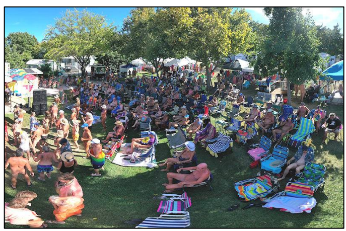
Ariel photo of Nudestock crowd at Laguna del Sol Nudestock 2019